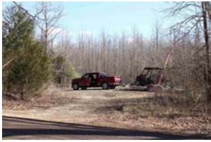
Farm Entrance off Pine Top Rd