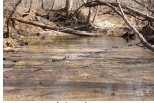
Year Round Creek