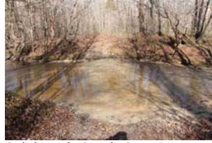
Solid Rock Creek Crossing