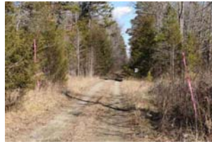
Road into farm