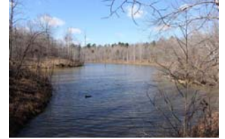
Stocked Pond 2