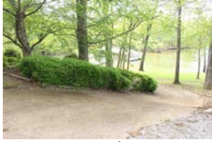
Driveway to Boathouse