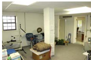
Bedroom 3 Downstairs