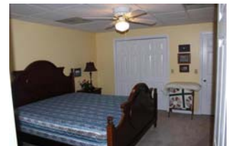
Bedroom 2 Downstairs